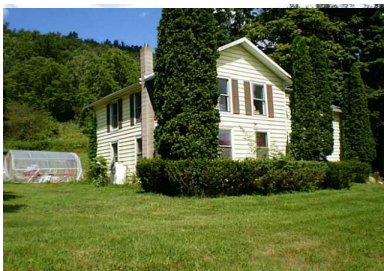
1240 ITALY VALLEY RD NAPLES, NY 14512

Cute cottage to start a tradition of summer getaways! Deeded shared Canandaigua lakefront, 88 feet of dead level beach, dock. Relaxed atmosphere on the east side to watch the sunsets. Cottage has two bedrooms, one bunk room and a queen bed in the other. Full kitchen, dining area and living room. Freshly painted, furnishings stay! Good size yard out front to play or picnic. Private drive, see signs and come check it out! Call Sue Polizzi! $89,900.