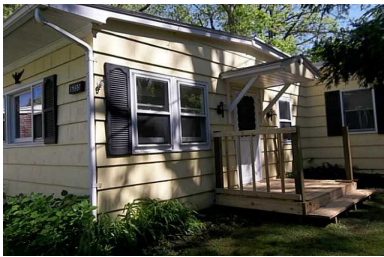
6355 GLENN AVE MIDDLESEX, NY 14507