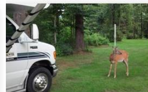
She was our regular visitor where we camped across from my brother's B&B in Thendara! Moose River B&B