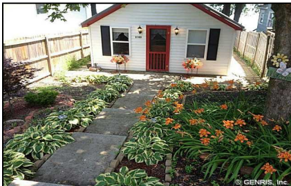
1245 Arrowhead Beach Rd., Dresden

Many updates! Newer roof, windows, triple pane windows, Butternut custom kitchen cabinets, fresh paint inside and outside. 3 Bedrooms, 2 full Baths, full basement, Shed & insulated garage. Level lawn, mature trees, storage shed, blacktop driveway, town water and low taxes. Call today to see this great home! Dan and Sandy King 585.703.4714 $167,500