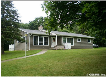
2193 State Route 245, Stanley

Many updates! Newer roof, windows, triple pane windows, Butternut custom kitchen cabinets, fresh paint inside and outside. 3 Bedrooms, 2 full Baths, full basement, Shed & insulated garage. Level lawn, mature trees, storage shed, blacktop driveway, town water and low taxes. Call today to see this great home! Dan and Sandy King 585.703.4714 $167,500