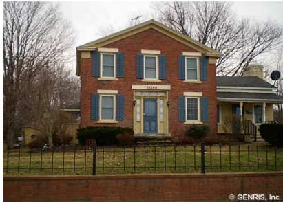
13226 Pond Rd., Butler, NY