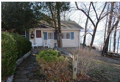
1064 Esperanza Dr., Keuka Park

Town of BUTLER - Lovingly preserved, updated 1880's 5 BR home. Mature landscape, water feature, vinyl fenced pasture, 24x24 barn w/loft, woods, open meadows & (6) acre pond! Call Team King 585.703.4714 or 585.703.5835 $449,900