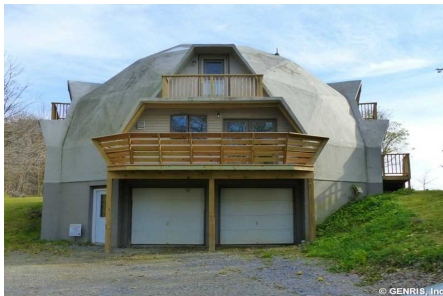
195 E. Swamp Rd, Penn Yan

Looking for Something Unique? Large Geo Dome!