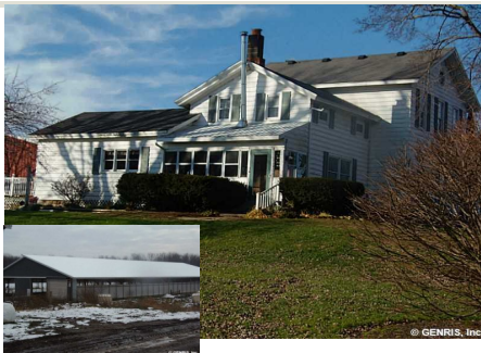
3105 Pilgrimport Rd., Lyons

PENN YAN/Town of Potter- Energy efficient, ready for your paint, flooring, bathroom fixtures. New septic & well. 5 BR. 5 Acres of Beautiful views, Apple Orchard & woods. Possible Owner Financing. Call Team King 585.703.5835 or 585.703.4714 $199,900