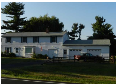
876 STATE ROUTE 54 PENN YAN, NY 14527