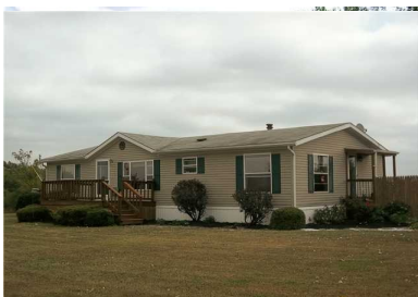
1753 INGRAM RD PENN YAN, NY 14527

Convenient location with lots of potential. Nice private back porch, over 1 acre yard, large newer 2 car garage. Open kitchen-dining area, first floor laundry, woodburning fireplace with built-ins and bay window in living room. Currently 5 bedrooms but could easily be made into 6 bedrooms. With some updating and a new owners touch will be a great home! Call Calvin Ruthven! $149,000.