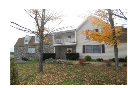
8032 County Route 70; Avoca, NY 14809