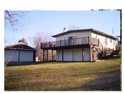
161 TIMBERLINE TRAIL; MIDDLESEX, NY 14507

This house is HUGE! 4 generous sized bedrooms with the possibility of more, large dining and family rooms-perfect for entertaining, office area with separate entrance, 2 decks, 2 car attached, drive-thru garage. Walk in attic over garage that could be converted to an apartment or business space. Ceramic shop set up in basement could convey. Quiet country setting close to Hornell or Bath minutes off 390 and 86.A great buy at less than $33/sq. ft.!! Call Sue! $199,900