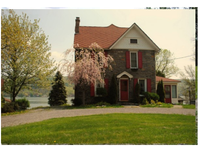
16132 WEST LAKE RD BRANCHPORT, NY 14418

Seasonal, or with a little work, year round home. Deck, 3 ponds, flowing creek, private lot, nearly 7 acres of woods, water, wildlife. 24X80! Polebarn plumbed for water, elec, radiant floor tubing installed, windows, patio doors, concrete flr. 2.5 miles from boat launch the polebarn will store all your lake toys! 2 bedrooms, enclosed porch, huge great room eatin kitchen with a little work this WILL be your little piece of paradise. Owner financing available. Call Sandy! $169,000