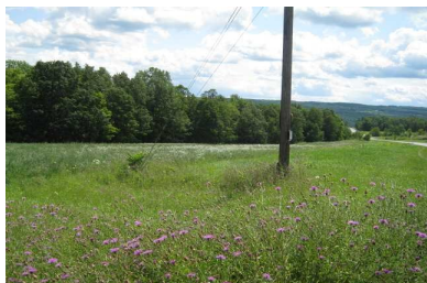
STATE ROUTE 364 MIDDLESEX, NY 14507