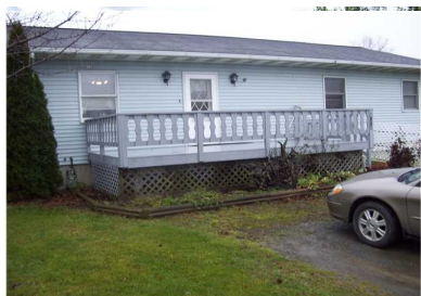
5003 DUTCH STREET DUNDEE, NY 14837

Commercial and/or residential zoning! Beautiful combination (50/50) of woods/open field on this 32+ acres. 1,500 ft. road frontage! Ideal Location for Business - good traffic. Includes some hardwoods, 2 small streams. Great hunting (deer, turkey, etc) & options for home sites. 2 min. to LAKE! OWNER FINANCE AVAILABLE with $33K down. Call Amanda Grover! $82,000.