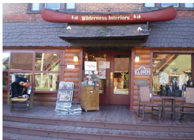
3038 STATE ROUTE 28 OLD FORGE, NY 13420