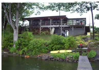
8896 WIXON RD HAMMONDSPORT, NY 14840

Bring your Family/Partners to the Adks. Highly successful/growing, turn key, established business dealing in Adirondack furnishings and decor. 5000 +sq ft retail space, storage, nearly 3000 sq ft owners/rental residence with 2 bd,2 bath very modern and private. CUSTOM kitchen, sunporch, and a LARGE Deck.3rd floor ready for expansion. Business is in a high traffic area, Outstanding curb appeal,2 offices,2 restrooms, New heating system,Garage,$1000's worth of wood working equ. OWNER FINANCING!GREAT CASH FLOW! Call Sandy King! $1,500,000.