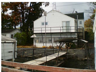
441 NEWLANDERS COVE RD PENN YAN, NY 14527

Totally renovated in '11. Energy saving finishes & appliances. Cathedral ceilings, wood floors. Kitchen, opens up to the dining & living room. 2 bdrms, master has full bath & second full bath on 2nd floor. 3rd bdrm, den, laundry & utility room on first floor. Amazing separate studio for art, dance, man cave, guest house! 2 car+ detached garage Waterfall! Trails! 1/10 mi. from West river boat launch, HiTor, <15 min to Bristol ski, <10 min to Cdga lk.! Call Sue Polizzi! $249,900.