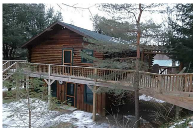
4725 STATE ROUTE 245 NAPLES, NY 14512